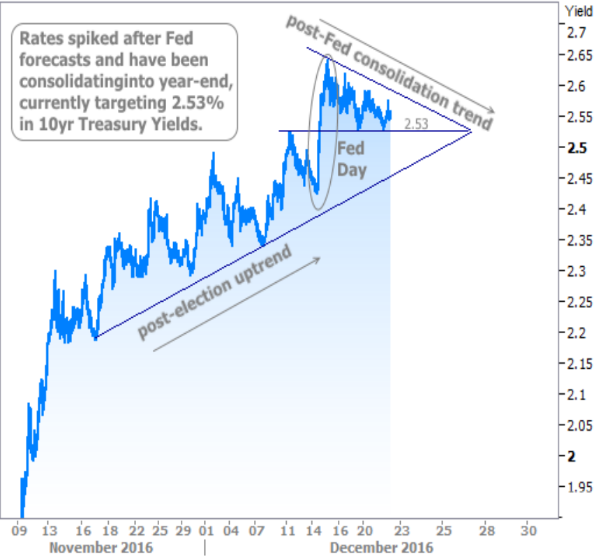
10yr Treasury Yield