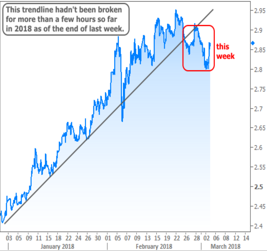
US 10yr Yield ("rates")