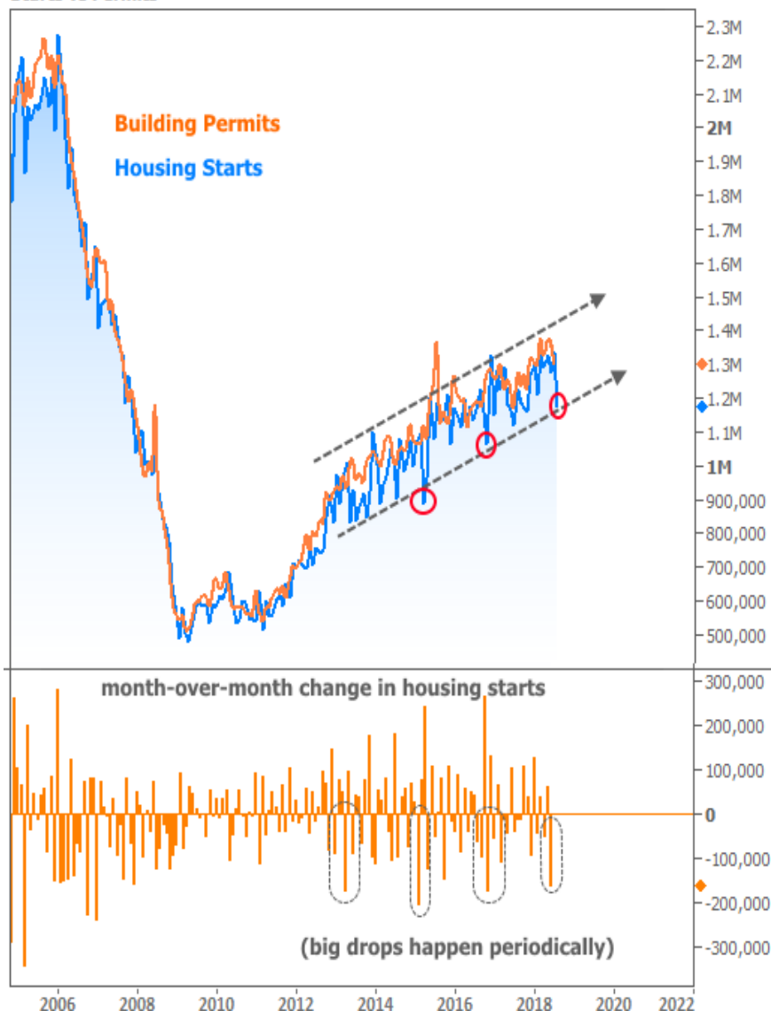
Starts vs Permits

Big drops in housing starts happen from time to time. And despite this particular drop, a positive trend remains intact.