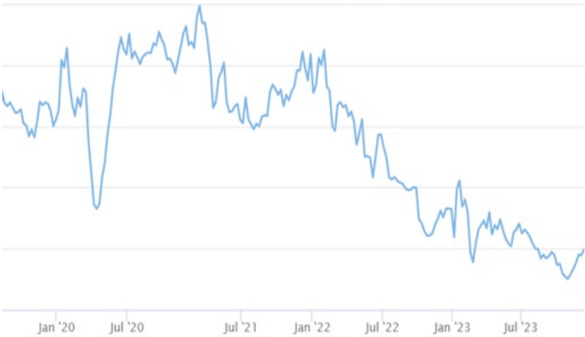
MBA Purchase Index

To get an idea of how much room we have for improvement, we can examine the exact same two metrics in a broader context.