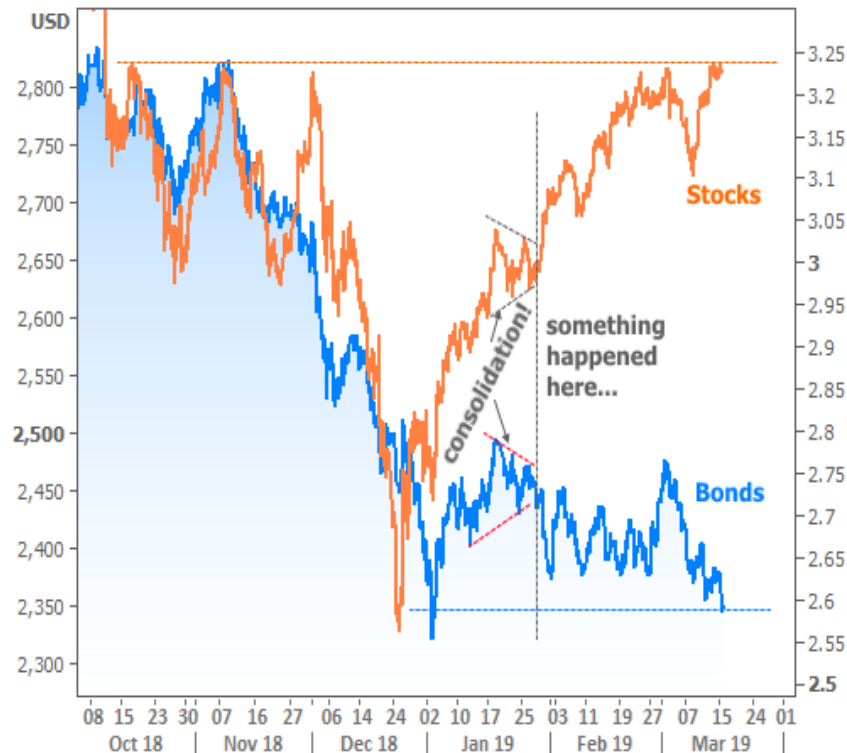
Rates vs Stocks

No, the Fed isn't getting ready to unveil another quantitative easing (QE) package, at least not directly. Indirectly, however, markets are about to feel the same sort of QE-driven euphoria. In fact, they've been feeling it for a few months now.