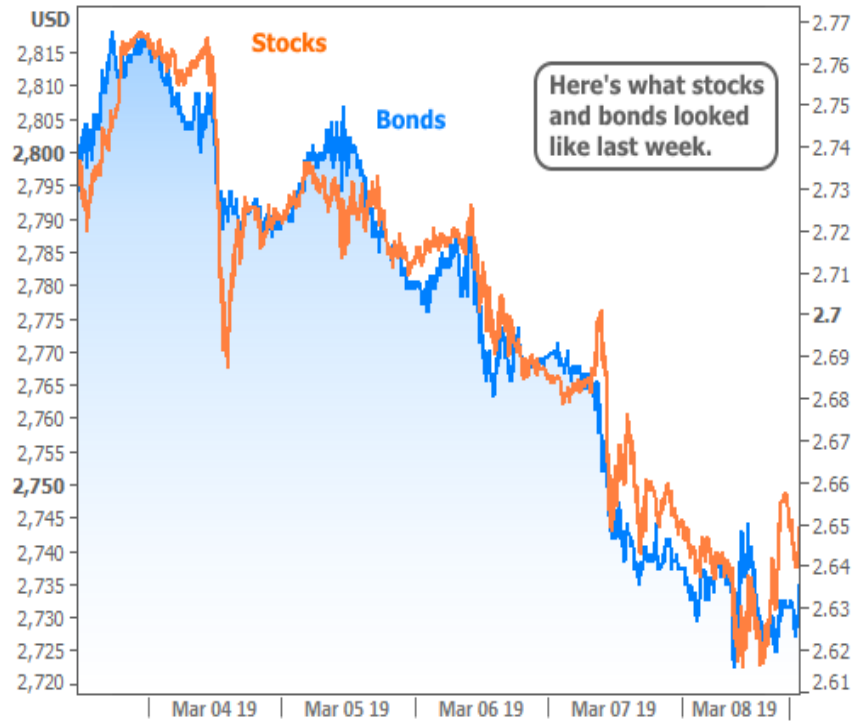
Rates vs Stocks

The next chart will incorporate all of the info above and add the current week to the mix using the same y-axis relationship from last week.