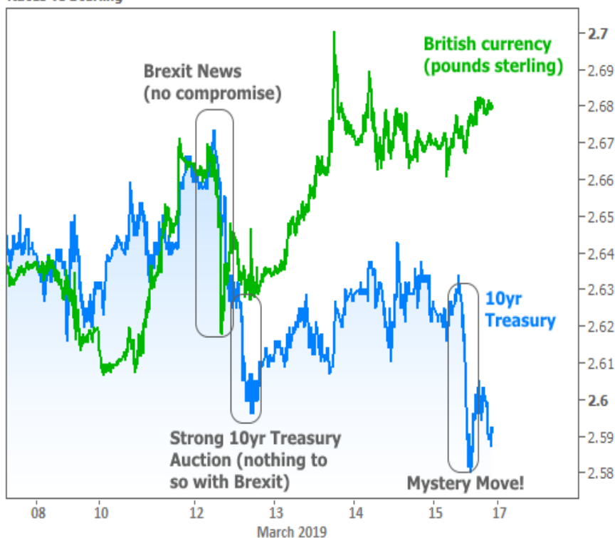
Rates vs Sterling

The 10yr auction was actually a revelation of sorts (circumstances suggested the auction could be tougher than normal). It carried bonds through the rest of the week with minimal damage, even as stocks and brexit sentiment argued for rates to move a bit higher.