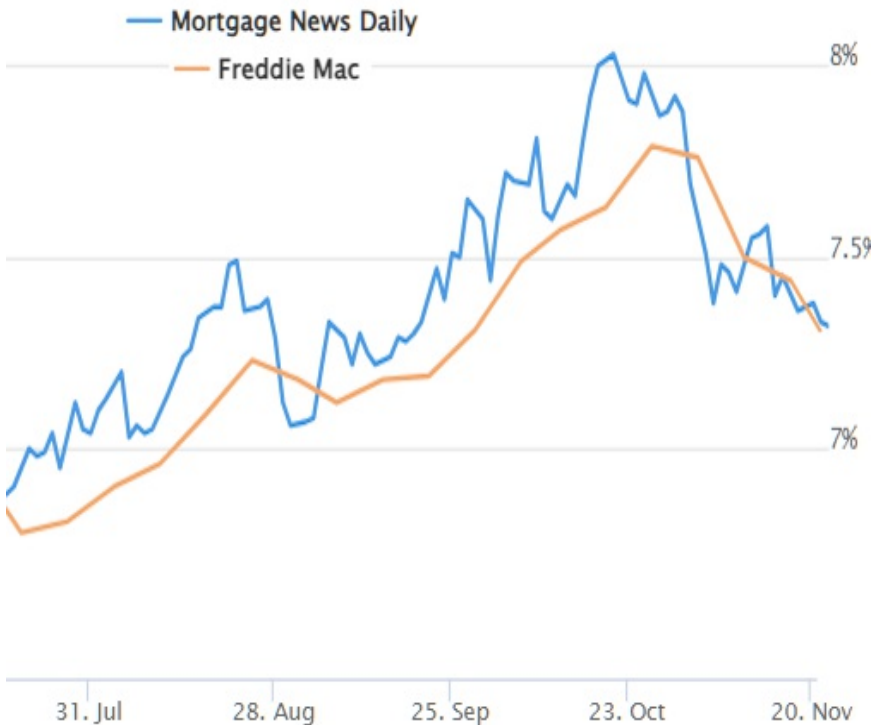
30 Year Fixed Mortgage Rates

Mortgage applications are already acknowledging the shift.