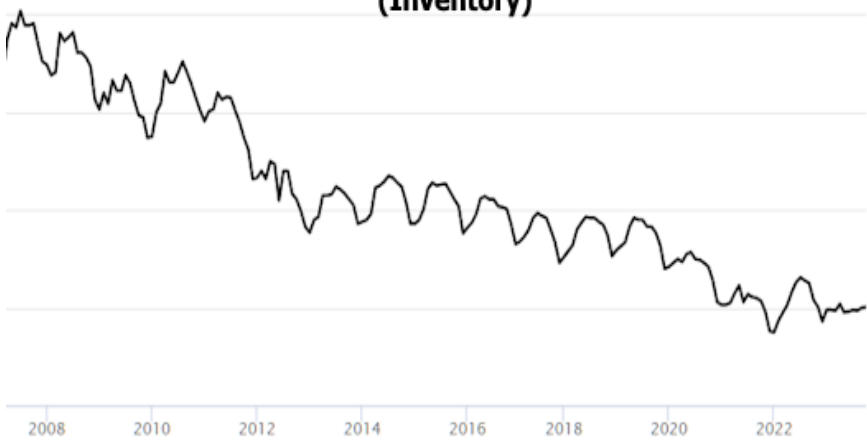
Existing Homes, Units Available For Sale (Inventory)

About those "highest rates in decades"... that's not exactly the case thanks to the past 4 weeks of improvement.