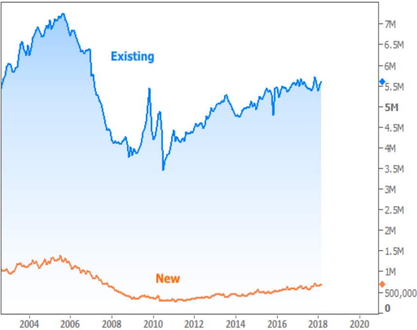
Existing vs New Home Sales

Next week brings the big jobs report (Employment Situation/Nonfarm Payrolls), which always has the potential to cause volatility for rates. Before that, we'll get a Fed policy announcement on Wednesday. The Fed can also cause huge moves for rates, but it's somewhat less likely next week. The Fed has 2 types of meetings: those that result in an announcement AND updated forecasts (as well as a press conference with the Fed Chair) and those that simply end with the announcement. Next week's is the latter, and that iteration tends not to pack the same sort of punch.