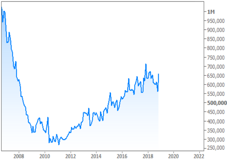
New Home Sales

In the same report, median prices of new homes had a completely different experience. They fell sharply.