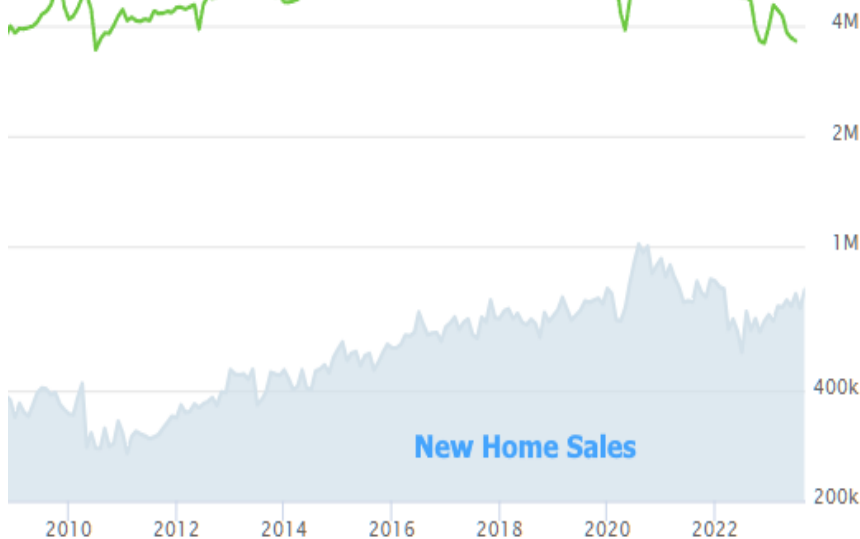
New Home Sales