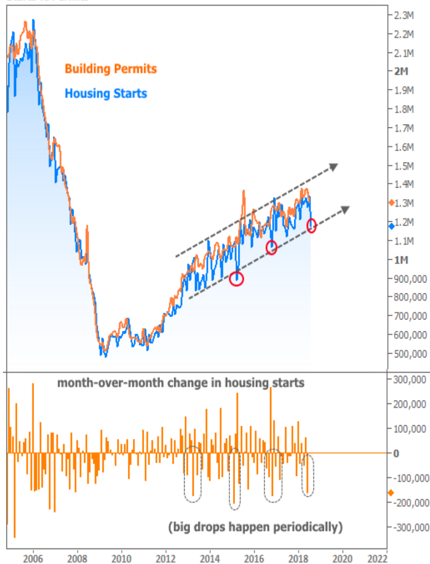
Starts vs Permits

Big drops in housing starts happen from time to time. And despite this particular drop, a positive trend remains intact.