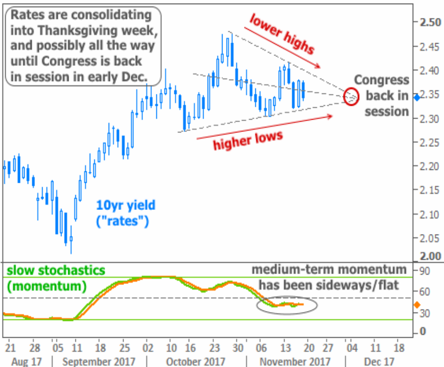
US 10yr Treasury Yield

In the spirit of "waiting and seeing," interest rates improved slightly this week. This keeps them locked in a consolidative trend (higher lows and lower highs) that's been underway for more than a month. It's the bond market's way of expressing indecision, and for now, the trend suggests indecision could linger at least through early December. Even if we apply some esoteric math to recent rate movement and derive a line that measures momentum, that line has been almost perfectly flat for several weeks.