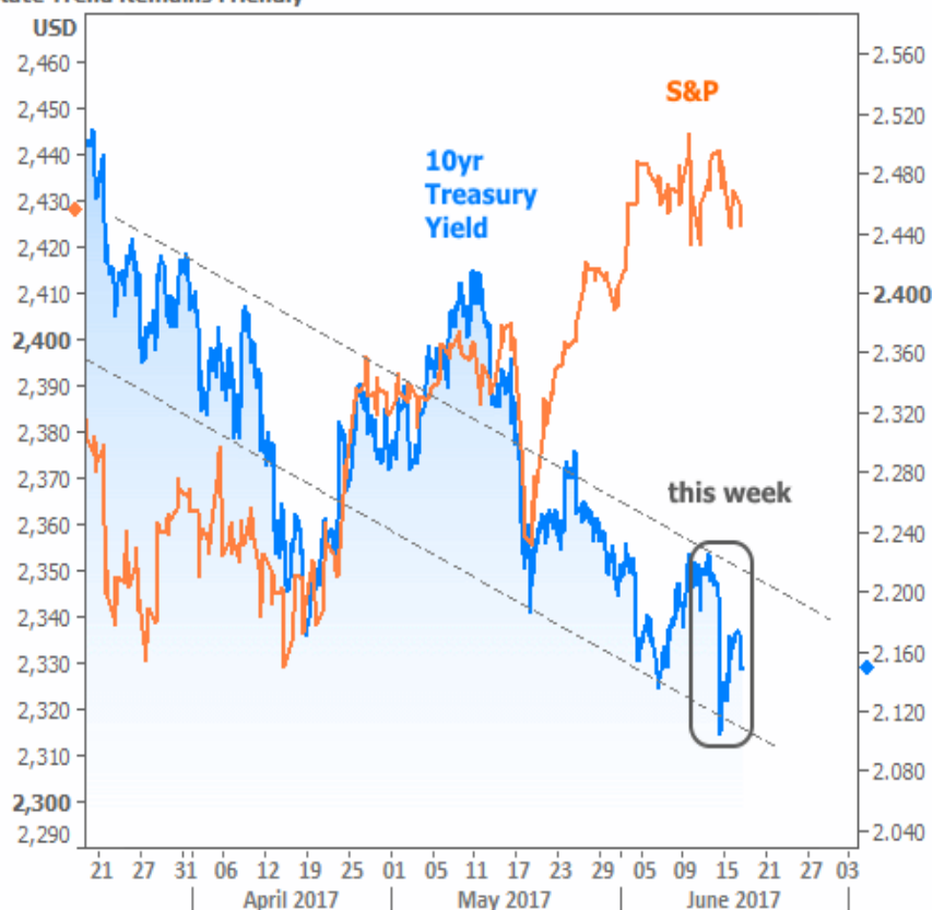
Rate Trend Remains Friendly

In housing-specific news, this week's economic data was generally downbeat . The National Association of Home Builders reported a drop in its Housing Market Index (a measure of builder confidence). In context, however, the index doesn't look like it's in trouble just yet.