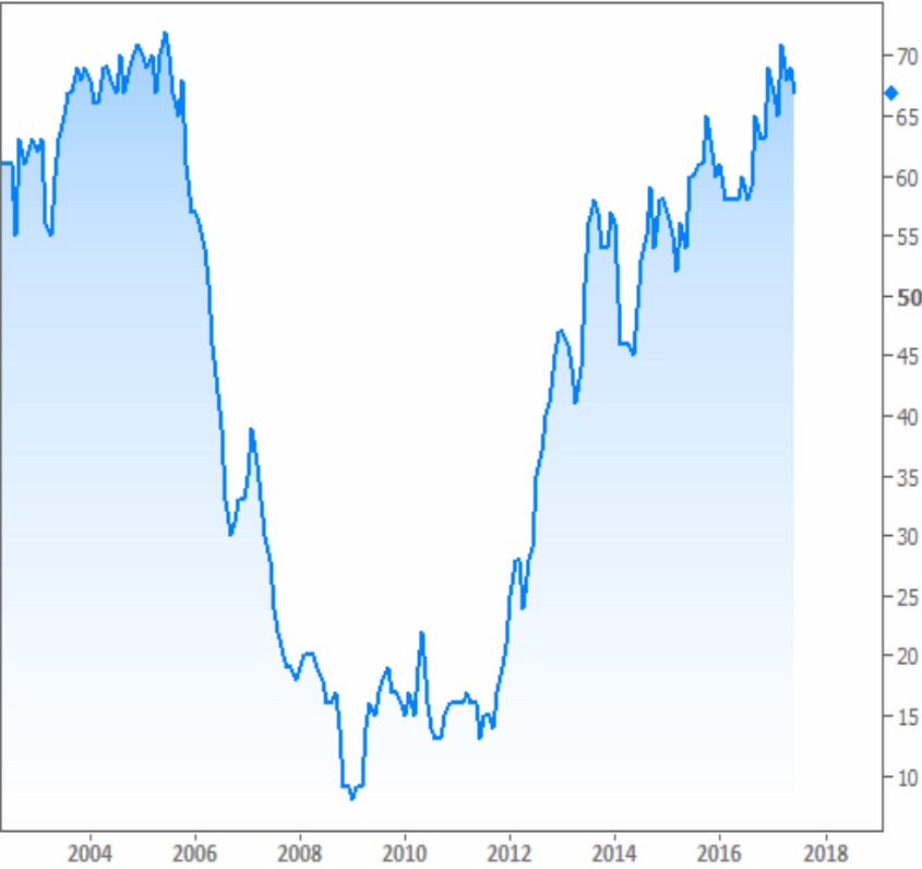
NAHB Housing Market Index

It's harder to offer a compelling counterpoint for Friday's New Residential Construction data from the Census Bureau. Both Housing Starts and Builder Permits came in well below forecasts, prompting National Association of Realtors' Chief Economist to say "housing shortages look to intensify and may well turn into a housing emergency if the discrepancy between housing demand and housing supply widens further."