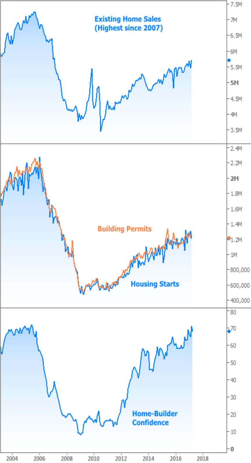
This Week's Housing Data