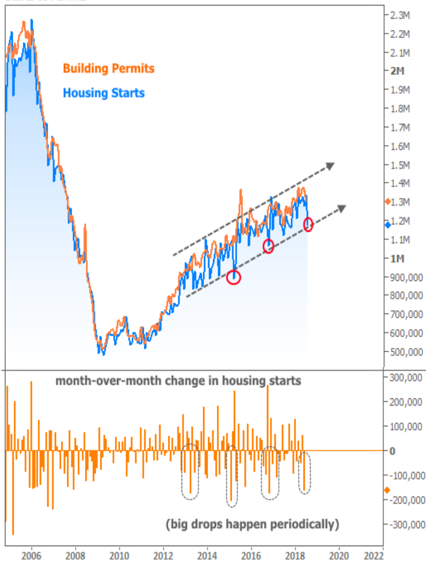
Starts vs Permits

Big drops in housing starts happen from time to time. And despite this particular drop, a positive trend remains intact.