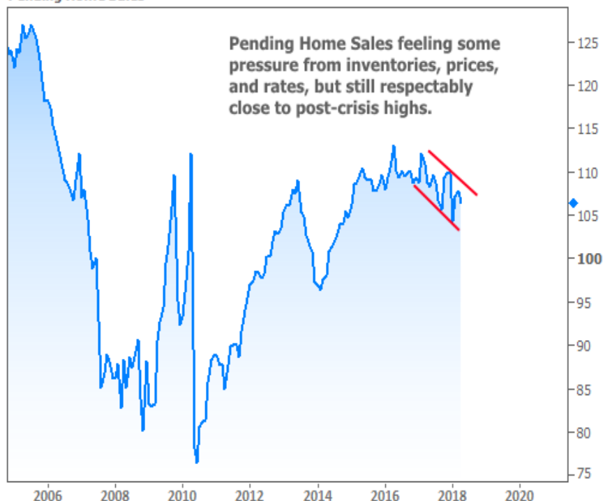
Pending Home Sales

Subscribe to my newsletter online at: http://housingnewsletters.com/kevinlitwicki