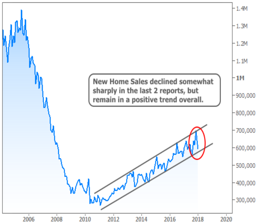
New Home Sales

Of course rates are far from the only input for home sales. As we discussed last week, inventory is an ongoing problem, as is affordability. The tariff news creates more uncertainty on that front. Tariffs could increase building costs and hinder the construction of affordable homes, according to Lawrence Yun, chief economist of the National Association of Realtors.