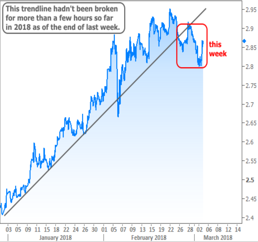
US 10yr Yield ("rates")