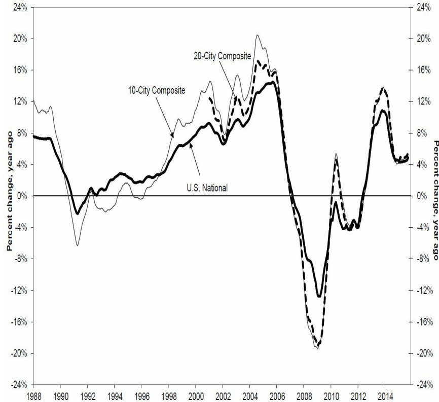
S&P/Case-Shiller Home Price Indices

Source: S&P Dow Jones Indices & CoreLogic