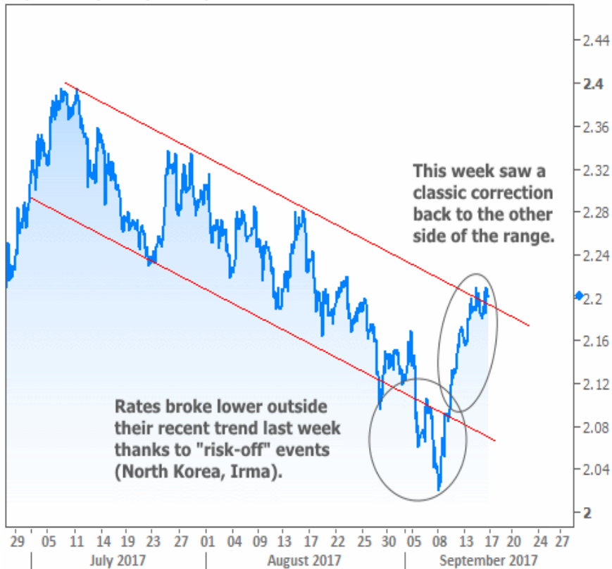
10yr Treasury Yield ("Rates")

The bulk of the correction took place during the first 3 days of the week. Rates found a supportive ceiling around 2.22% in terms of 10yr yields, but weren't interested in moving much lower for a few reasons. The most obvious reason would be that last week's gains were based on temporary factors.