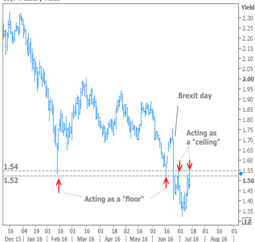
10yr Treasury Yields

Of course, when it comes to financial markets, repetitions of past patterns won't always predict the future. However, repetition does build a case for a certain level being significant. It's as simple as this: if rates hardly ever break through a given level, it's easier to argue that it means something when they do.