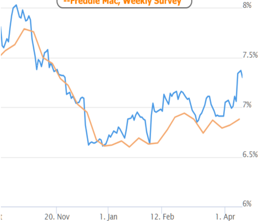
Mortgage Rate Indices --MND, Actual Daily Average --Freddie Mac, Weekly Survey

Why did we see such a big reaction for such a small deviation in the data? Simply put, the market keeps waiting for a trend toward lower inflation to resume and the data keeps breaking hearts. This week's report was sort of a "third times the charm" moment. Jan and Feb CPI (released in Feb and Mar, respectively) were also surprisingly high. They did damage to rates to be sure, but markets and even officials from the Federal Reserve were hoping those reports were outliers.