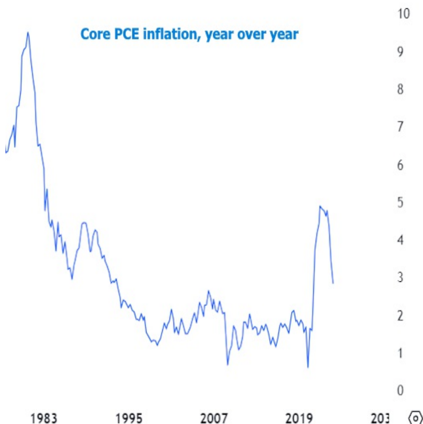
Core PCE inflation, year over year

While it's no longer necessarily a top priority, the Fed would also not mind seeing some more slack in the labor market and some other signs of economic weakness to bolster the case for further disinflation. If the economy is too strong, they need to wonder if inflation might pick back up.