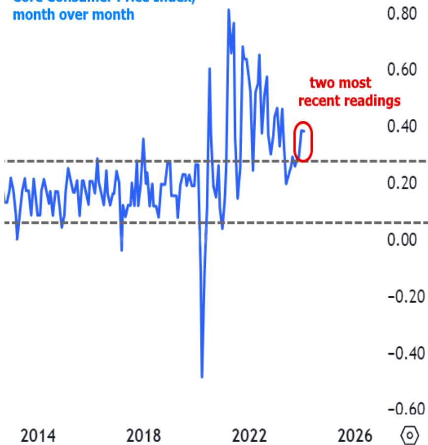
Core Consumer Price Index, month over month

The news wasn't quite as bad from the week's other key inflation report, but it certainly didn't help. The Producer Price Index (PPI), which measures wholesale inflation, has also now seen the highest two consecutive months since inflation first began to calm down in 2022.