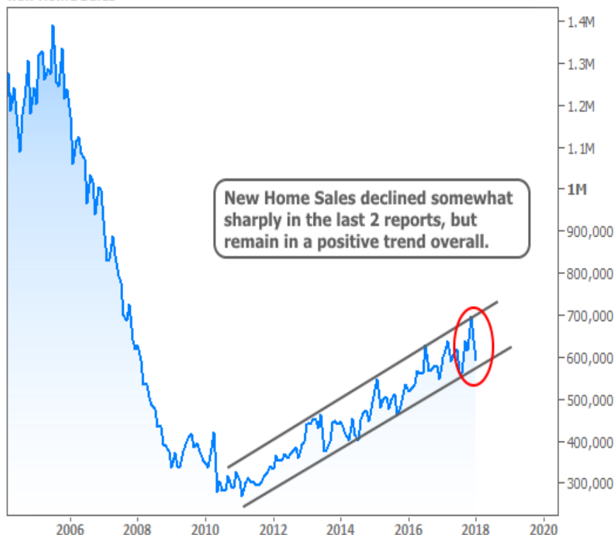
New Home Sales

Of course rates are far from the only input for home sales. As we discussed last week, inventory is an ongoing problem, as is affordability. The tariff news creates more uncertainty on that front. Tariffs could increase building costs and hinder the construction of affordable homes, according to Lawrence Yun, chief economist of the National Association of Realtors.