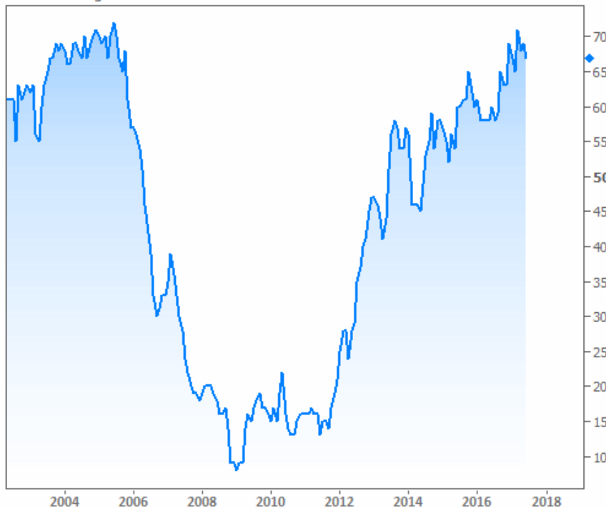
NAHB Housing Market Index

The HMI is constructed from responses to a survey NAHB has conducted for more than 30 years among its new-home builder members. They are asked to provide their perceptions of current single-family home sales and sales expectations for the next six months as "good," "fair" or "poor." The survey also asks builders to rate traffic of prospective buyers as "high to very high," "average" or "low to very low." Scores for each component are then used to calculate a seasonally adjusted index where any number over 50 indicates that more builders view conditions as good than poor.