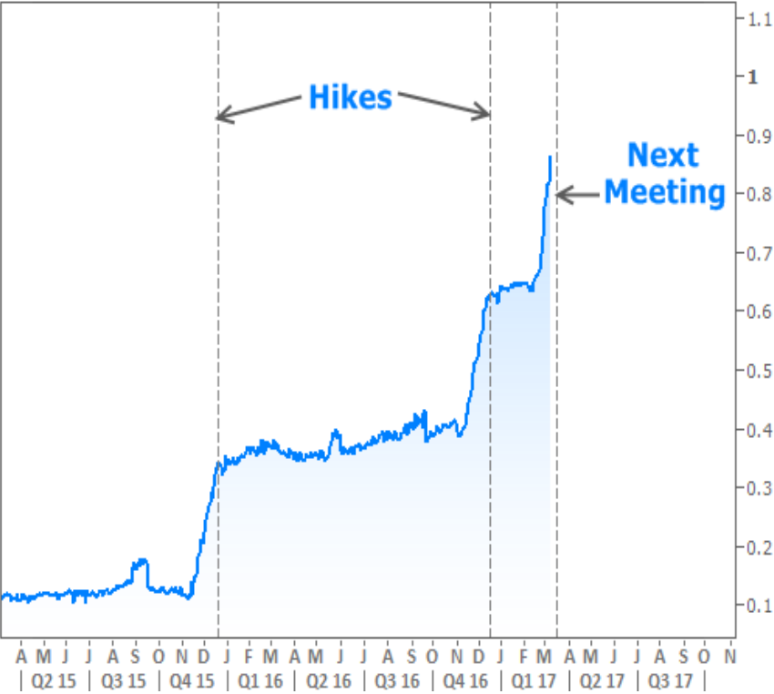
Another Fed Rate Hike Metric (OIS)

The trajectory of the blue line over the past month means billions of dollars are already actively prepared for next week's hike... done deal... pointless to wonder anymore. It would take something truly astonishing (in a bad way)