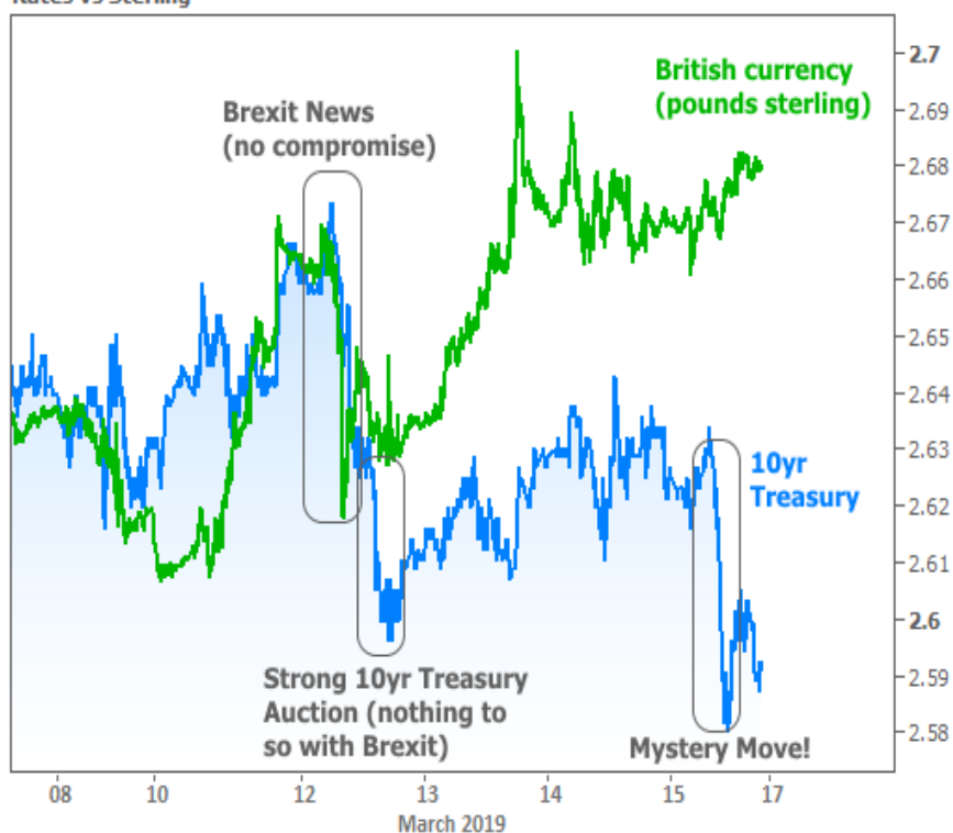
Rates vs Sterling

The 10yr auction was actually a revelation of sorts (circumstances suggested the auction could be tougher than normal). It carried bonds through the rest of the week with minimal damage, even as stocks and brexit sentiment argued for rates to move a bit higher.