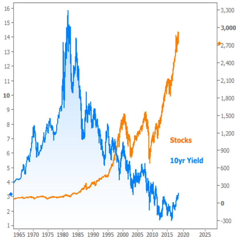
stocks vs bonds

Despite the chart above, stocks and rates actually DO spend quite a bit of time moving in the same direction. In fact, the only real misconception is that they're ALWAYS moving in the same direction. Sometimes, they're joined at the hip. Other times, they're clearly moving in opposite directions.