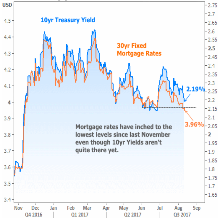
Treasuries vs Mortgage Rates

As long as 10yr yields remain above those lows, mortgage rates won't be willing to move too much lower. Whether or not those lows are broken depends on several factors.