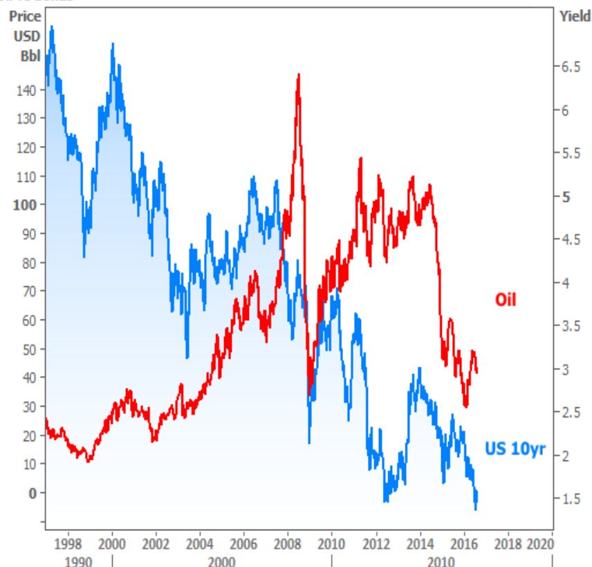
Oil vs Bonds

If it looks like rates and stocks have moved in exactly the opposite direction since 2009, it's because they have! The correlation with oil is slightly more defensible, but still far from relevant in the short term. It's currently receiving extra attention due to the massive drop in 2014, persistent weakness since then, and fear that prices will continue to fall.