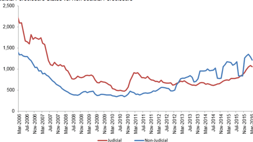
Figure 1 – Number of Mortgaged Homes per Completed Foreclosure Judicial Foreclosure States vs. Non-Judicial Foreclosure

Completed foreclosures were up in March, with a substantial increase compared to February, but continued to fall on an annual basis. CoreLogic said that there were 36,000 foreclosures during the month, an increase of 9.3 percent from the 33,000 recorded during the previous month. However, foreclosures were down by 14.9 percent compared with March 2015 when there were 42,000. Despite the March bounce the 36,000 total is nearly a 70 percent decrease from the peak of the housing crisis (September 2010) when there were 117,782 homes lost, however the total remains significantly higher than the average of 21,000 foreclosures per month between 2000 and 2006.