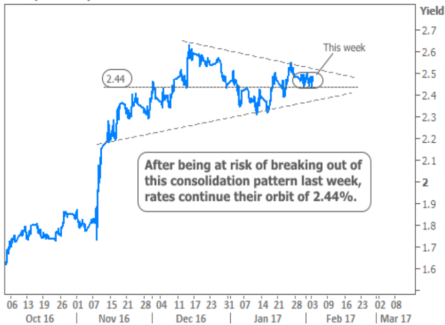
US 10yr Treasury Yield

In addition to the Fed, there were several important economic reports this week. Chief among those was Friday's nonfarm payrolls data (the big "jobs report"). Although payroll growth outpaced expectations, wage growth not only fell short, but was also revised lower for the previous month. Wage metrics are closely-watched by both markets and the Fed right now, with the expectation being that rising wages will stoke inflation and thus, faster rate hikes. The weak wage data helped rates hold their ground.