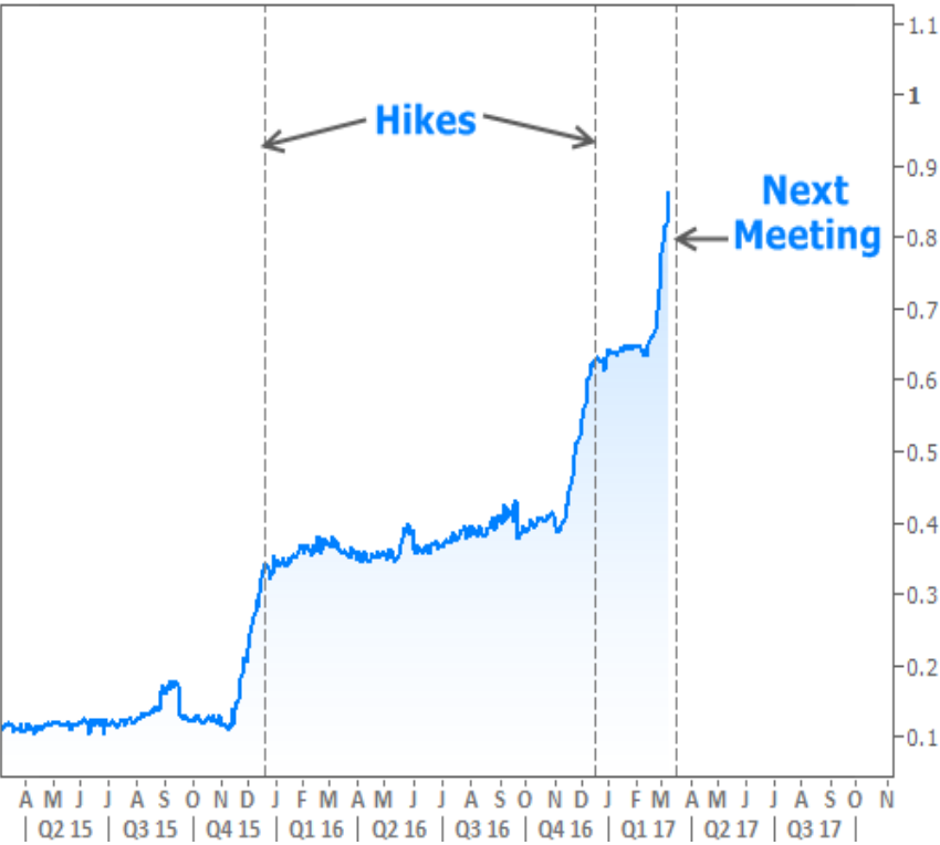
Another Fed Rate Hike Metric (OIS)

The trajectory of the blue line over the past month means billions of dollars are already actively prepared for next week's hike... done deal... pointless to wonder anymore. It would take something truly astonishing (in a bad way)