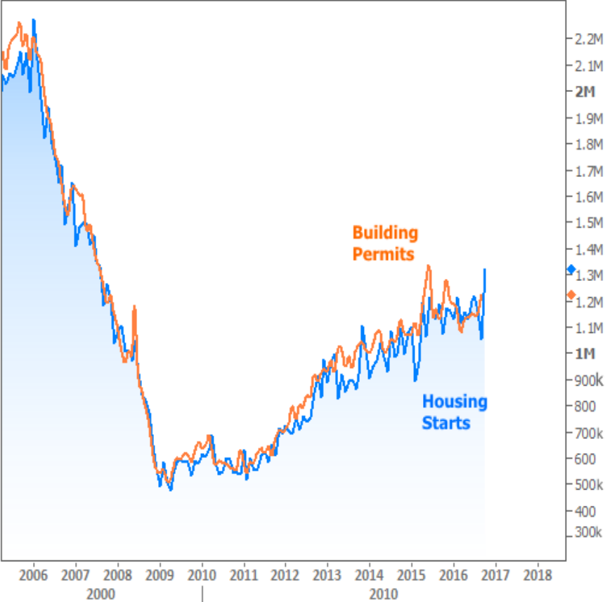
Housing Starts and Building Permits

Subscribe to my newsletter online at: http://housingnewsletters.com/clicknfinance