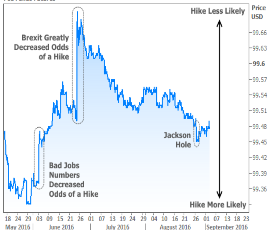
Fed Funds Futures

The comparatively bigger swings seen in June make the recent movement seem much more arbitrary (i.e. rates have been more volatile than the Fed rate hike outlook would suggest). This fits perfectly in line with the concept of markets simply having run out of patience for the increasingly narrow range of rates. Long story short: if you forced financial markets to pick the next move in rates, they'd probably choose "higher," but there is at least some hope that the answer will change when they get back in the office after the 3-day weekend.