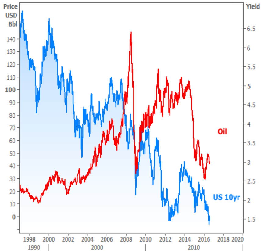
Oil vs Bonds

If it looks like rates and stocks have moved in exactly the opposite direction since 2009, it's because they have! The correlation with oil is slightly more defensible, but still far from relevant in the short term. It's currently receiving extra attention due to the massive drop in 2014, persistent weakness since then, and fear that prices will continue to fall.