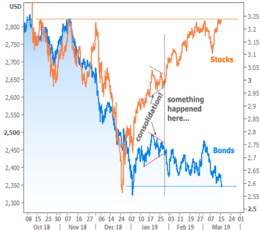
Rates vs Stocks

No, the Fed isn't getting ready to unveil another quantitative easing (QE) package, at least not directly. Indirectly, however, markets are about to feel the same sort of QE-driven euphoria. In fact, they've been feeling it for a few months now.